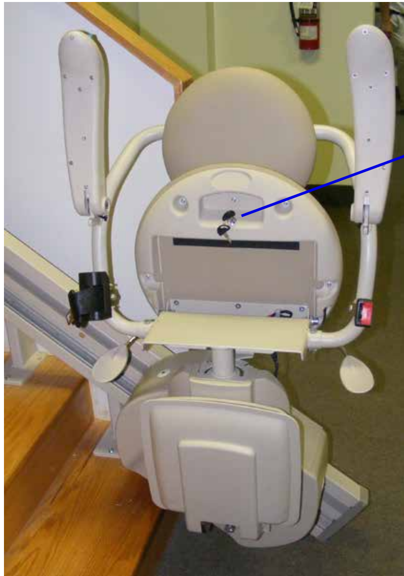
Figure 2 shows the AmeriGlide Vesta Stair Lift in its folded up position.